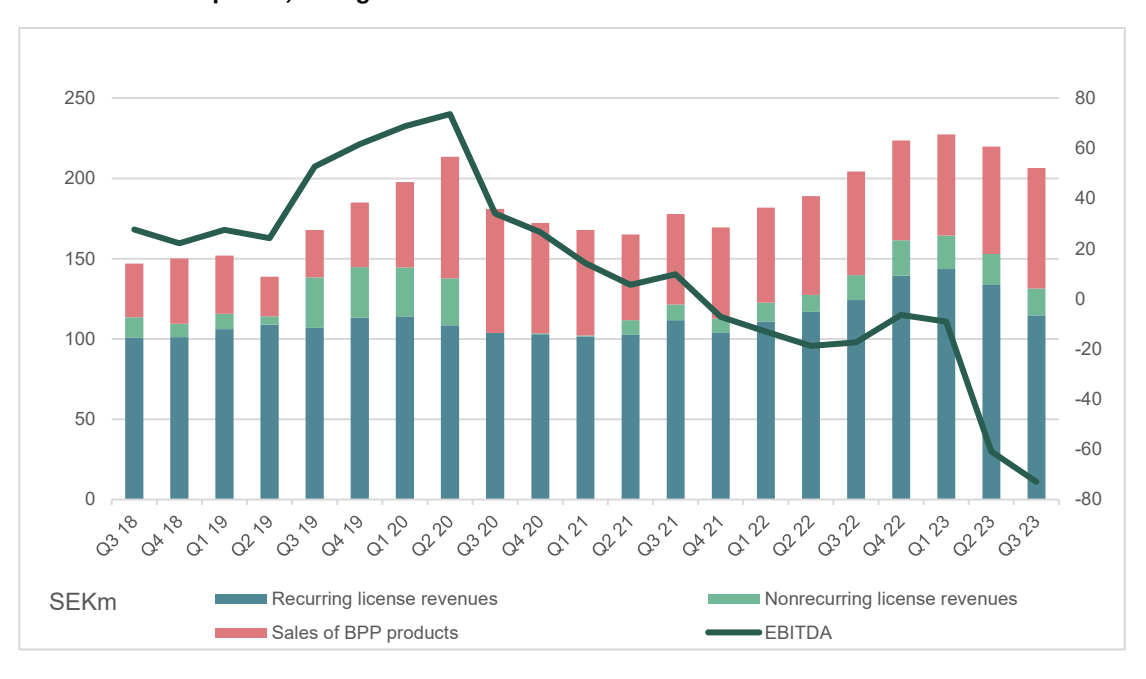
The chart shows how revenues for each type of revenue stream have developed over a rolling 12 month period per quarter.